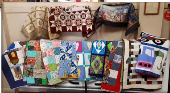
Gifting quilts for Whalers