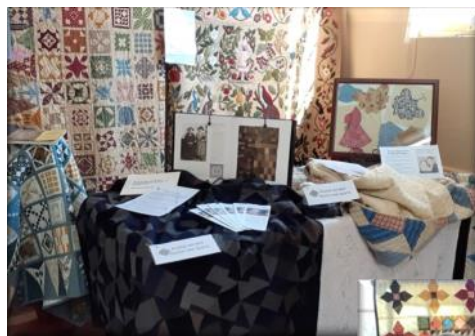
Carolyn Ewers Display