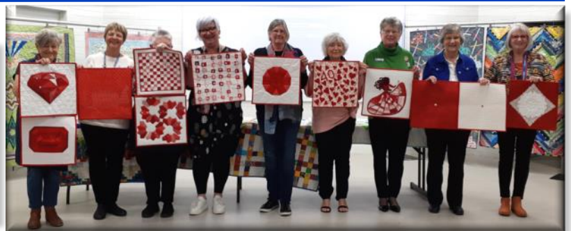
The President's 2023 Challenge quilts