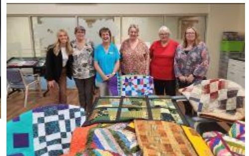
Quilts Gifted to Estia Kadina