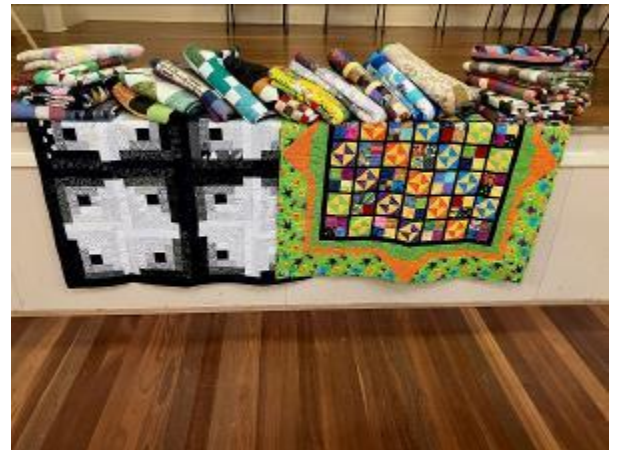
21 Gifting Quilts gifted to the RAH