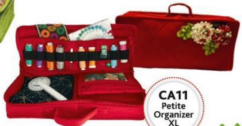
CA11 Petite Organizer XL

Get your creative juices flowing with the Yazzii Bags and open up new horizons!