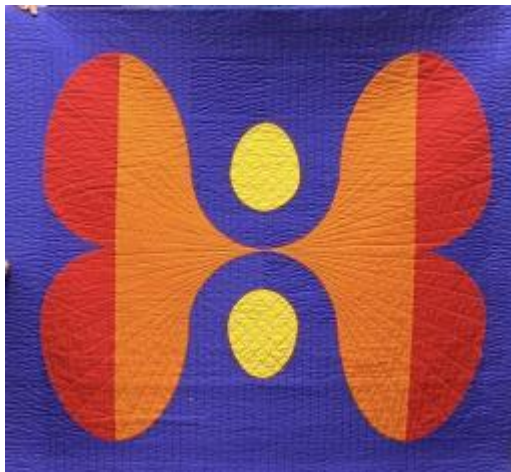
Jeanne Treveavan 1