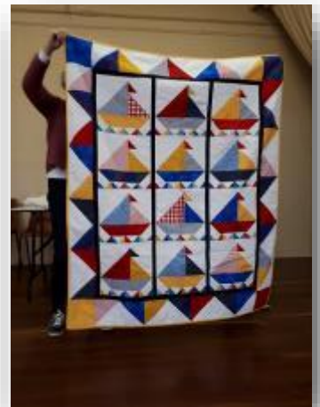
Two of the quilts gifted to “Laklinyeri” Beach House