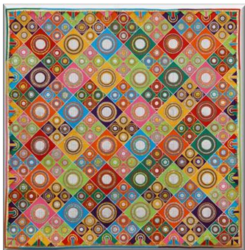
Contemporary Category. "Help me Boab" by Linzi Upton.