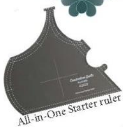
All-in-One Starter ruler