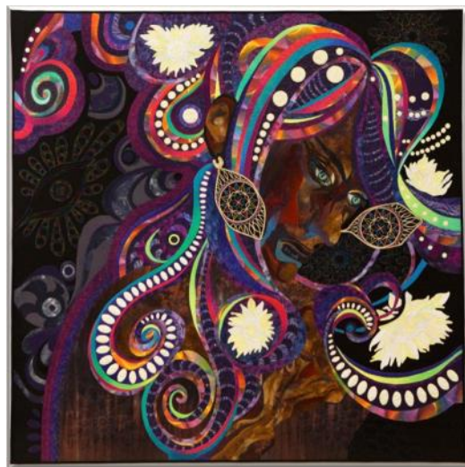
Pictorial Category. "Confusion" by Janneke de Vries Bodzinga.