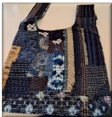
The Knot Bag