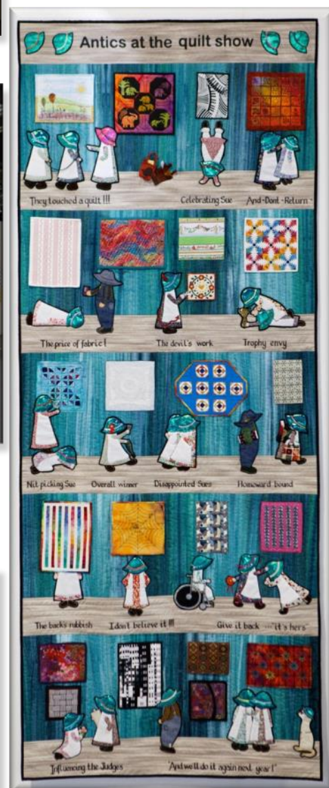
Best of Show "Antics at the Quilt Show" by Nine to Five