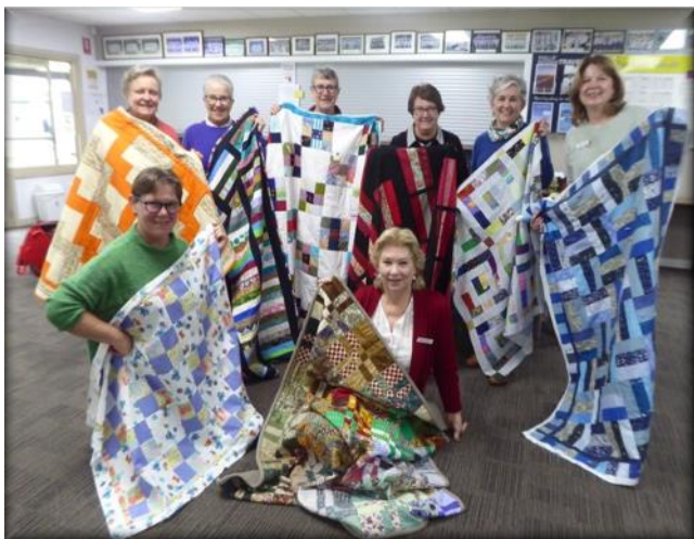
Some finished quilts from our June workshop