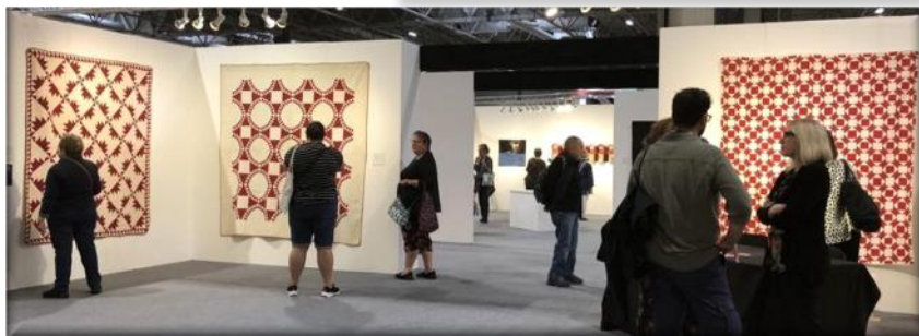
Red and White quilt display