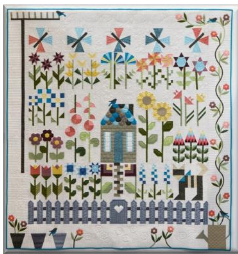
Groups Category. "Cottage Garden" by Comberton Quilters.