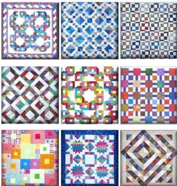
A sample of the patterns designed by Clayton's