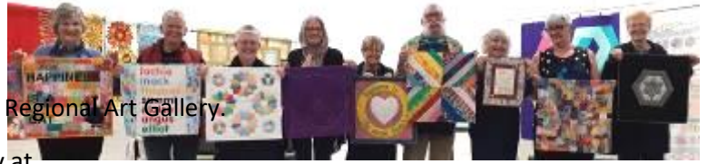
Members showed their President's Challenge 20 inch square quilts.