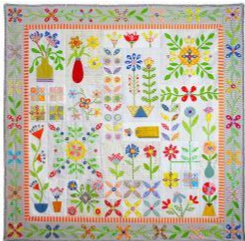
2 Day workshop—In Full Bloom with Irene Blanck