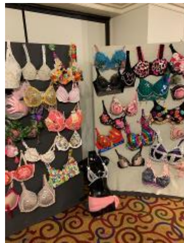
Decorated Bras from 2022 30th Anniversary Challenge