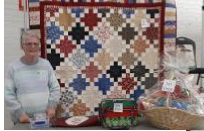
Beryl from Port Elliot Patchworkers featured their raffle at the meeting with three beautiful prizes.