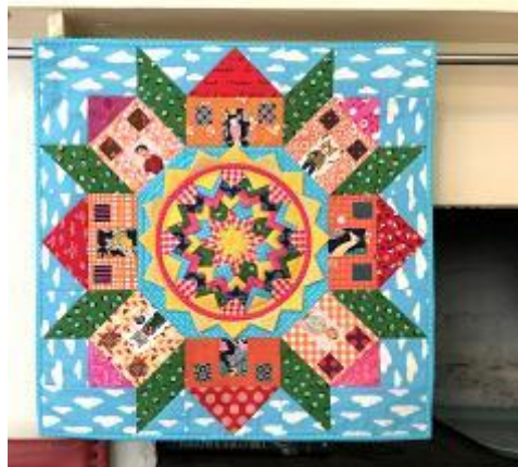
2 Day workshop—Sunny Days in Daisy Town with Rachael Daisy