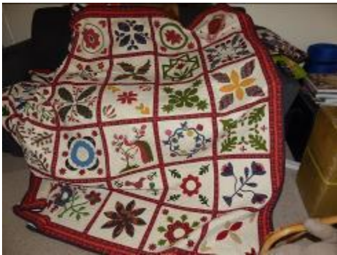
The quilt above is called "Saturn and the Stars." It is hand appliqued, hand quilted and has won awards in the Royal show as well as for being the best hand quilted quilt at Festival of Quilts.