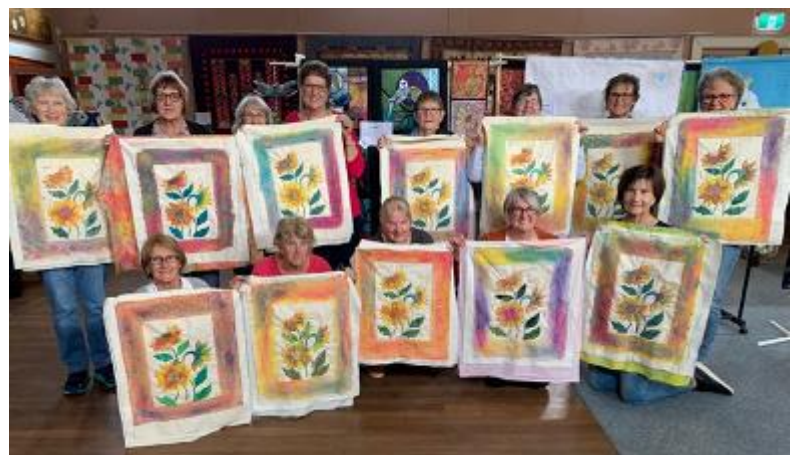
'Arty Farty Sunflowers'