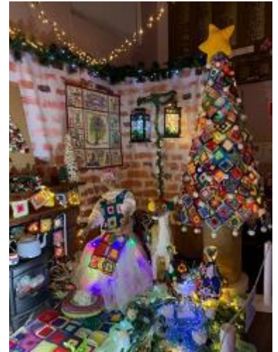
Christmas Wonderland Display