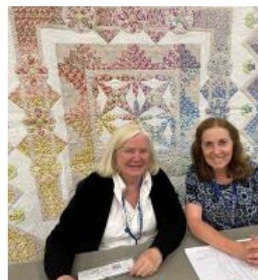
2023 Festival of Quilts Raffle Quilt