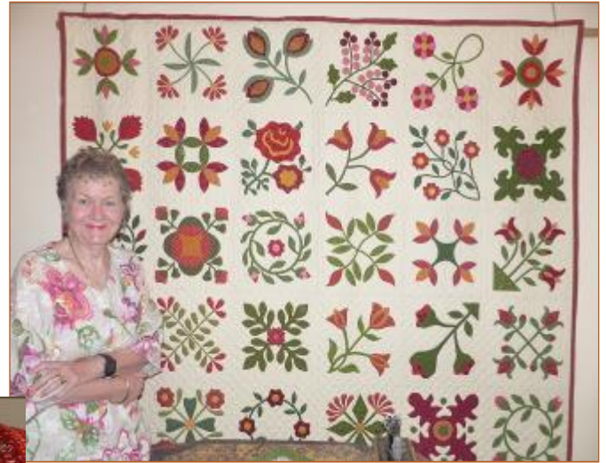
This quilt is based on a Circuit Rider's Quilt and is hand appliqued and hand quilted.