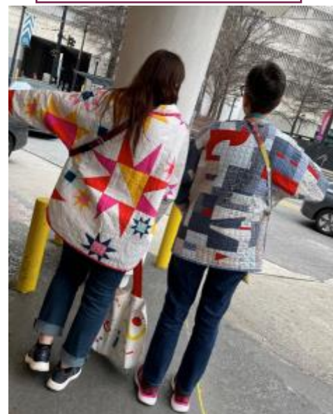
Pip's jacket drew plenty of attention in Atlanta.