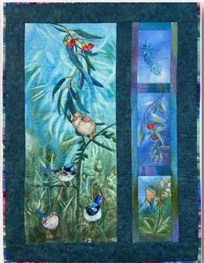
Superb Fairy Wren