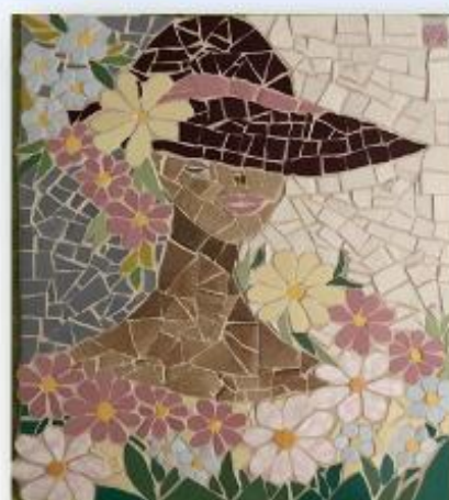
2nd Prize - "Peggy the Vintage Lady" Mosaic (31 x 39 cm)