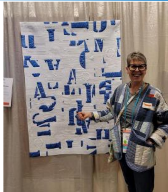
Covid - it's all Greek to me 101 x 138cm

This year, a record-breaking 2,099 quilts were entered. Competition was fierce with 481 quilts juried into the exhibition so Pip's win was truly wonderful. Congratulations from all of your fellow SA Quilters Pip!