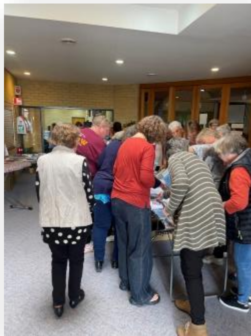
Picking the Kits.