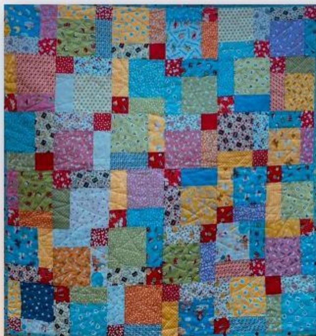
Baby Cot Quilt Designed for Beginner's

This course is aimed at women attending pre-natal classes at the various hospitals, health clinics etc