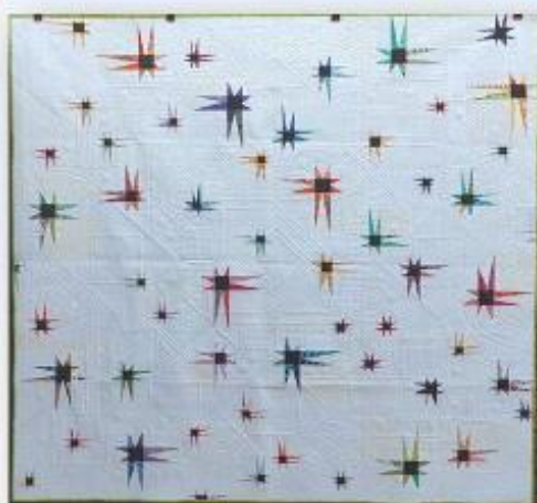
1st Prize - "Stars on Vermont" Quilt (175 x 175 cm)