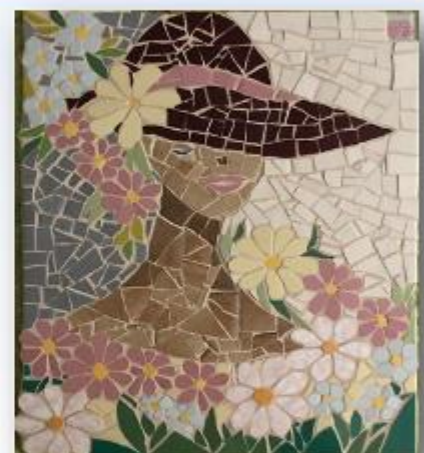
2nd Prize - "Peggy the Vintage Lady" Mosaic (31 x 39 cm)