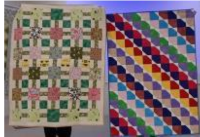
Bron's Flinders Kids quilts