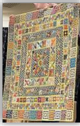
Midnight at the Oasis