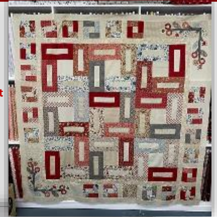
2022 Raffle Quilt

The Club currently has 31 members who meet on the second Wednesday each month, in the CWA building at Minlaton from 10:30am. New members most welcome.