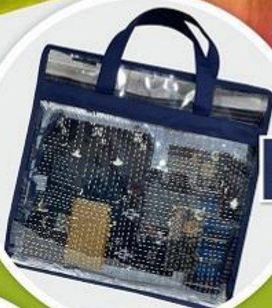
CA371 Quilt Block Carry Case