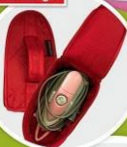
CA555 Iron Storage Case Large