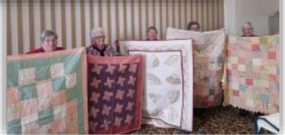
Quilts donated to the Queen Elizabeth Hospital Renal Unit