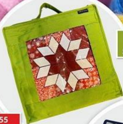
CA370 Quilt Block Showcase Bag