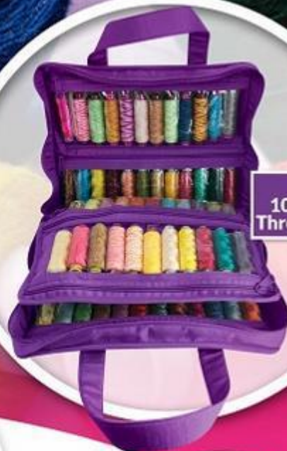
CA635 100+ Ultimate Thread Organizer