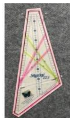
The Squedge: one of Heather's favourite rulers

See the way Heather uses story boards to develop her quilting design for each project, and have a close-up look at the fabulous results of using each ruler to its maximum benefit.