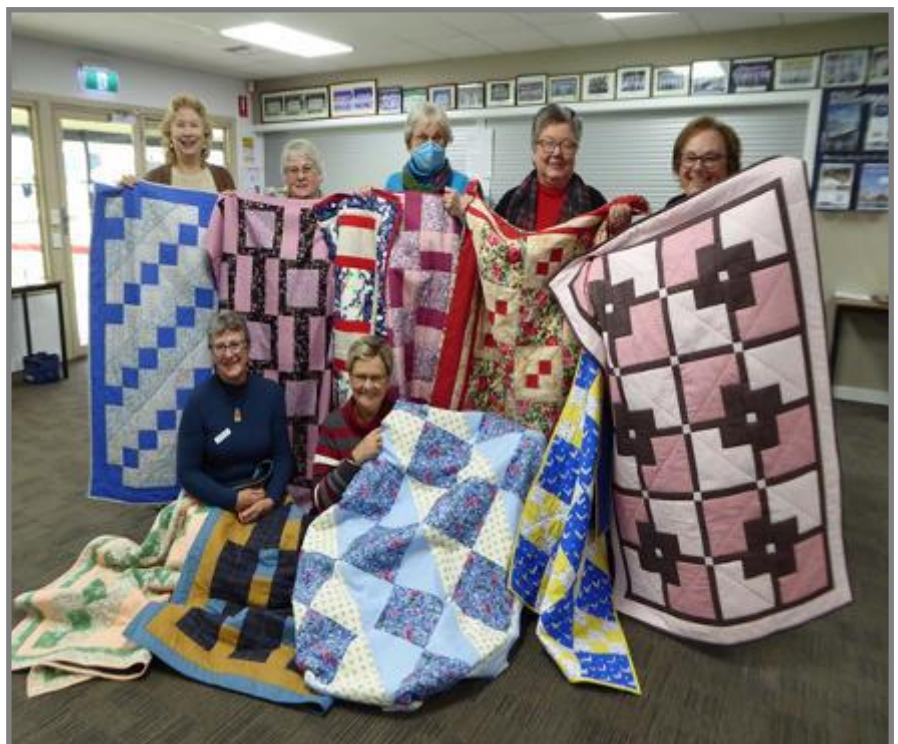
Some of the completed "Three Yard Quilts"