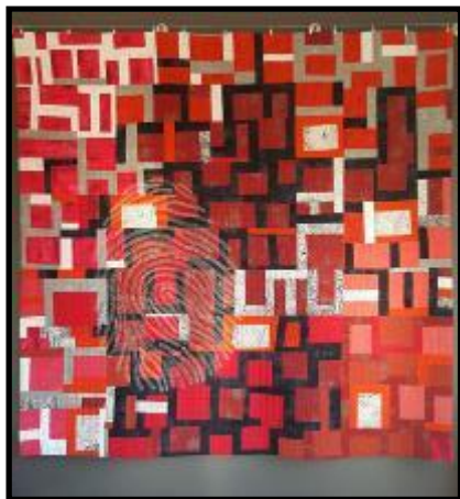
Left: Crime Scene 1 – His fingerprints were all over it!