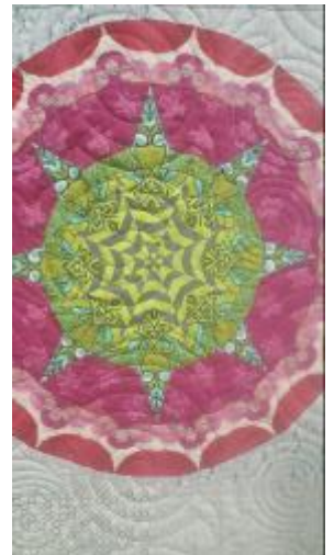
Some blocks from Calicos, Cuties and Compasses

The I-Patch team welcomes news and information from our members and member groups. Please forward unformatted (yes, this is important!) text (Word) and photos to ipatch.saquilters@gmail.com