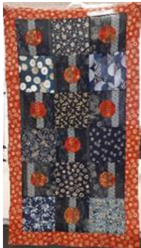
Jan's quilt top in the Japanese theme