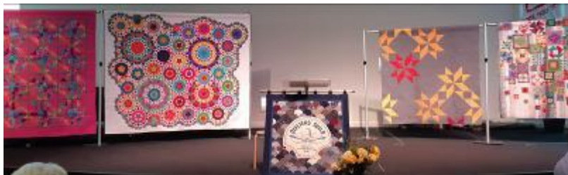
A mini exhibition of modern quilts framed a backdrop to the stage.