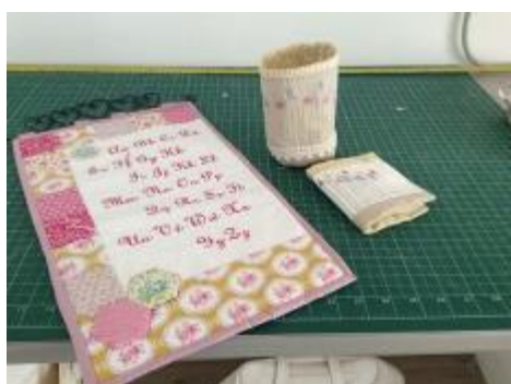
Liz's Project Bag