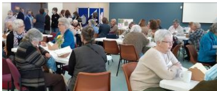
The dining room offered a great opportunity to catch up with friends.