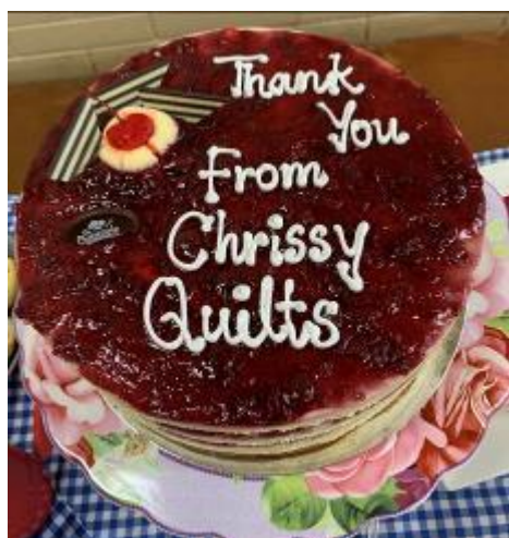
The celebration cake..