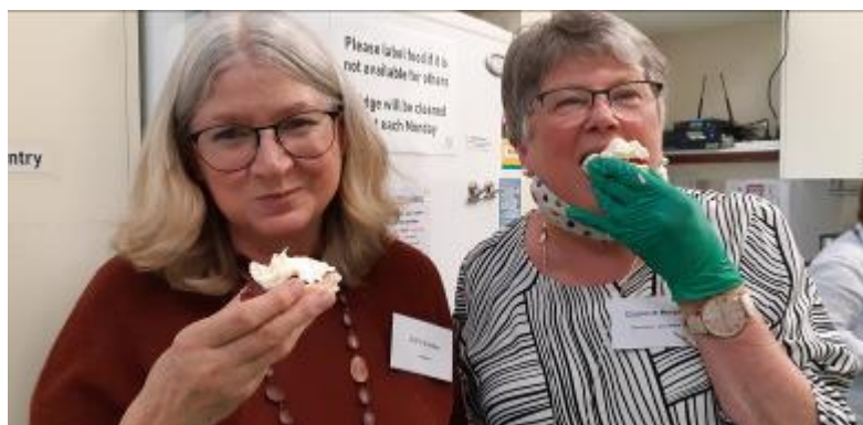
Thank you Café Finniss for the wonderful catering!