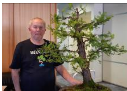
And... a huge thank you to a hugely supportive partner who made coming to CF possible...and we loved watching your bonsai get a trim.