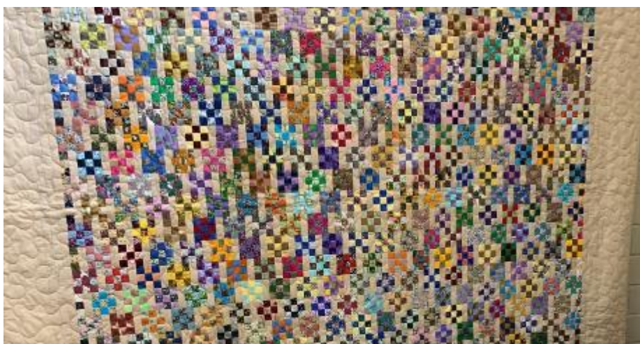
This beautiful quilt was raffled on the day.