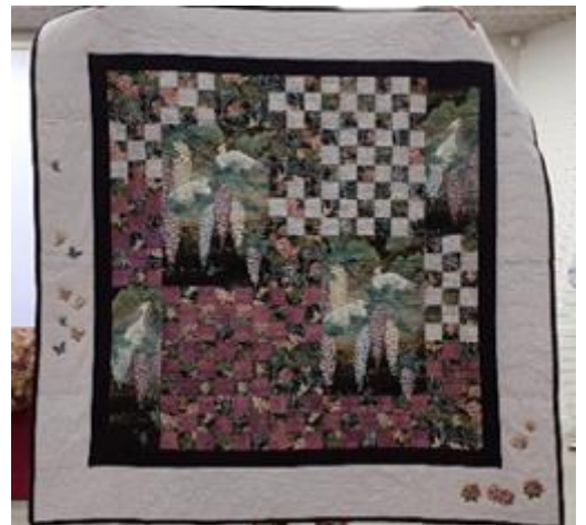
Emilie's flowers and cranes