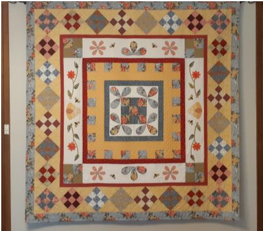
An early round robin quilt.