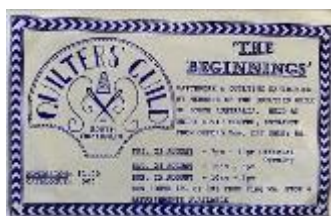
An early QGSA Exhibition label

The exhibition was a huge success, we couldn't believe so many people wanted to see quilts