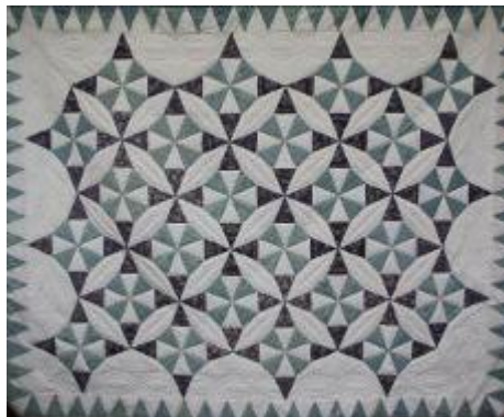
This quilt is made with the South African fabric

an abrupt halt as our eldest daughter became very ill so for the next few years I was not involved with the Guild.