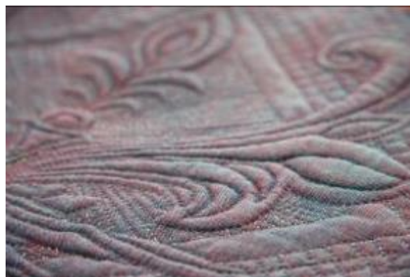
My cupboard door. The design of this small piece comes from a cupboard door - cotton quilted in metallic thread with trapunto