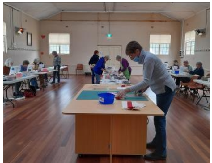
The Inman Valley Quilters hard at work.