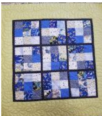
A selection of lock- down mystery quilts made by members.