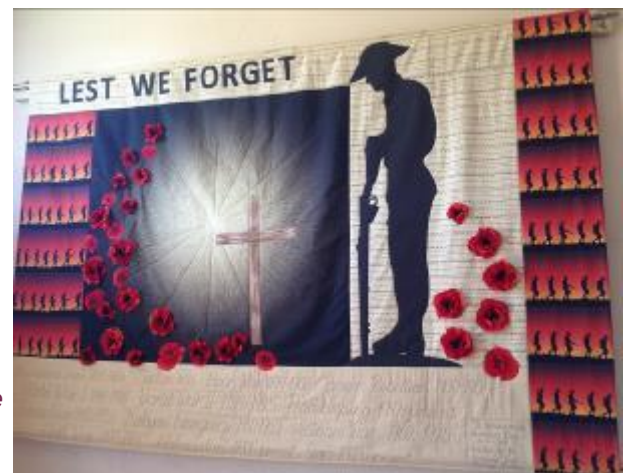
First RSL quilt made to commemo- rate 100 years after the end of the First World War