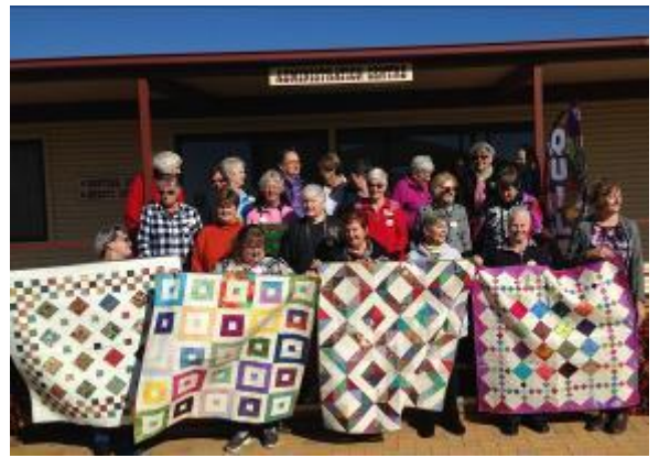
Bedford Mystery Day