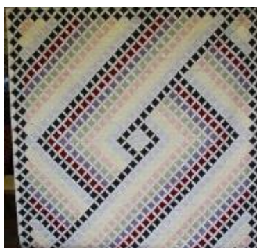
Integrated Diamonds - cathedral window quilt hung at the first SA quilt exhibition at Unley Town Hall

A family holiday to the US in 1999 reignited my passion for quilting, a few days in Pennsylvania looking at beautiful Amish quilts sent me on another journey.