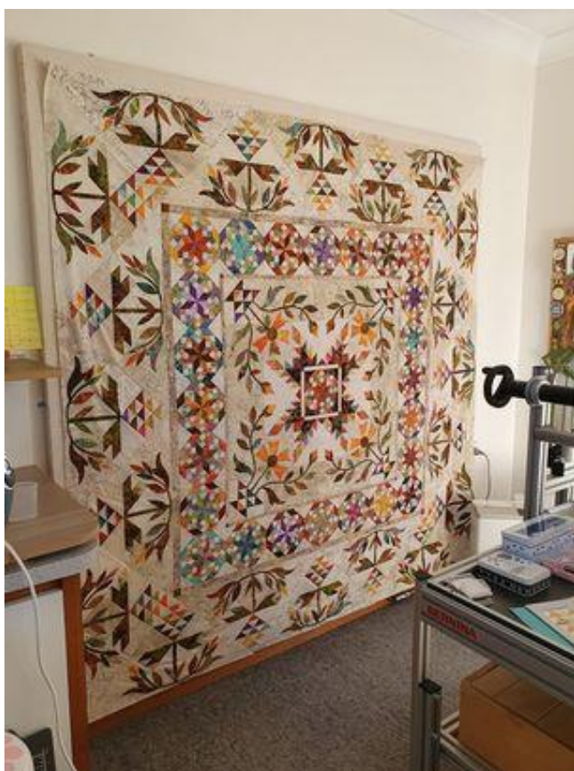
Pip's current WIP

I'm looking forward to catching up with some of you at Quilt Encounter!!