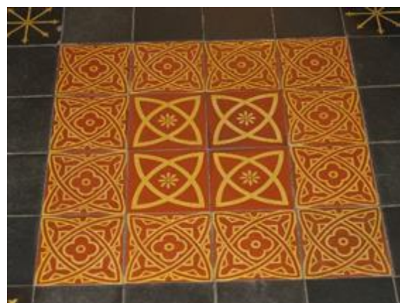
A travel inspired quilt.