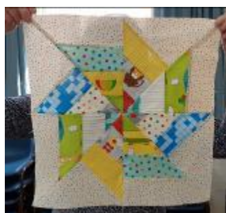
Pauline's cheerful block.