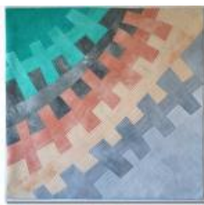
Some of the Beautiful Quilts on display at the 2019 Dare to Differ Exhibition