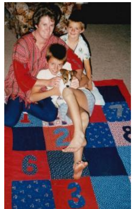
My first quilt—1990s