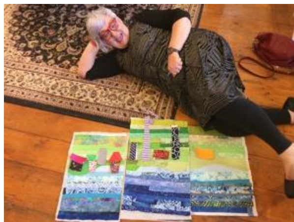
Cindy's Wonky Houses