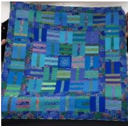
Kerryn's Blue/Green quilt