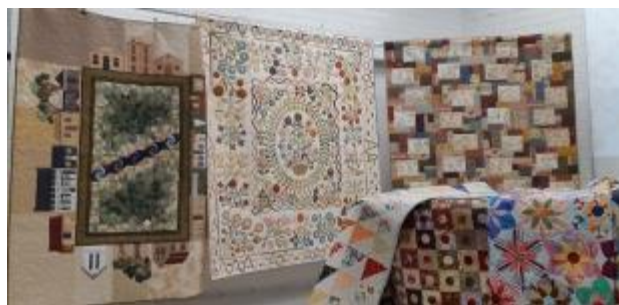
The Melrose Tribute quilt is on the left