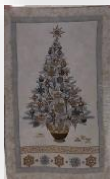
Carol - Christmas panel