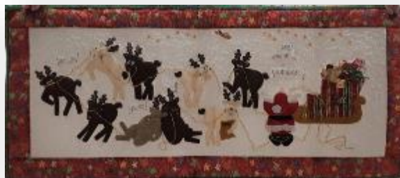
Jan - wall hanging