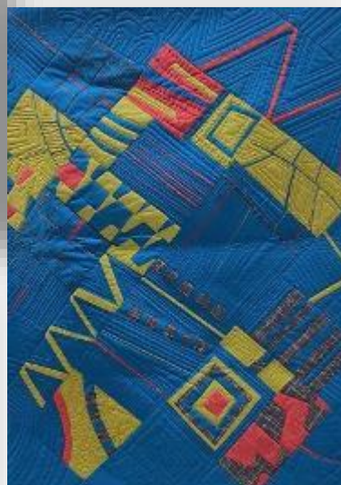
Pip - Mildura Retreat