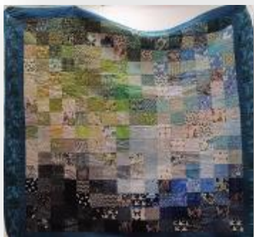
Lara - quilt for Mum