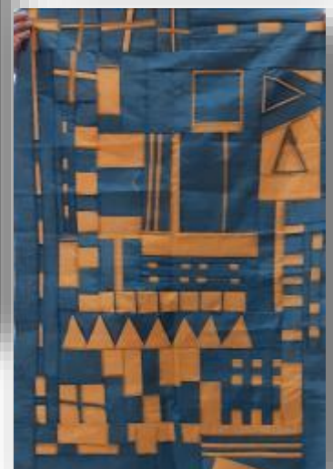
Candy - Mildura Retreat