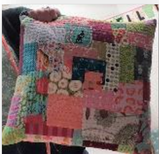
Lara - kawandi cushion